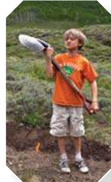
When I grow up . . . building community by building trails CRESTED BUTTE LAND TRUST