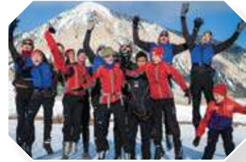
CBNT jumps for joy in new team uniforms. CRESTED BUTTE NORDIC TEAM