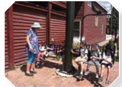
Learning from those who went first PARADISE PLACE VISITS CRESTED BUTTE MUSEUM