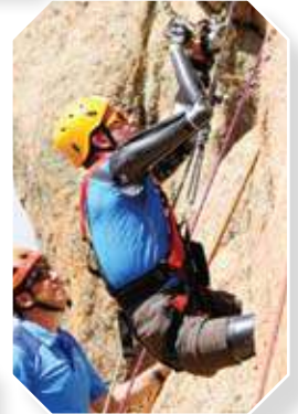
Reaching new heights! Imagine the determination and zest for life! ADAPTIVE SPORTS CENTER