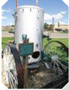
A moment in time. Preserving and sharing the past . . . for the future. PIONEER MUSEUM