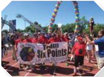
Scuff-proof shoes! Turning the ordinary into extraordinary by overcoming life's obstacles. Six Points clients take achievement and perseverance to the next level. SIX POINTS EVALUATION & TRAINING