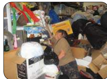
BULGING AT THE SEAMS

At the heart of this, and all the stories you will read in this newsletter, are caring, sharing people. Community generosity makes the stories come to life. Thanks . . . we're all "Here for Good."