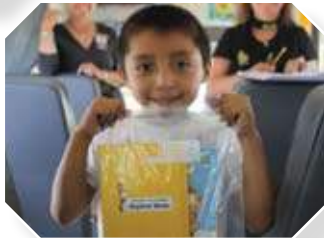
Books on wheels! Rockin' readers like this kiddo "check out" books from a library on wheels during summer months. SEÑORITA RITA'S ROCKIN' READING ROUTE