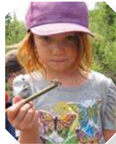
Touch, see, feel. Young scientists explore the world with hands-on field work.