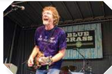
Music feeds the soul. World-class performances all summer long. CRESTED MUSIC MUSIC FESTIVAL