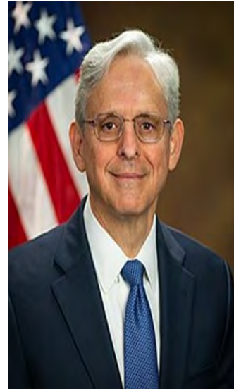
Merrick Garland Attorney General of the United States