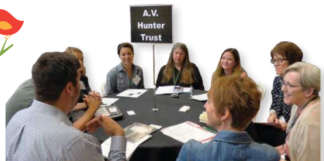
RURAL PHILANTHROPY DAYS ROUNDTABLE