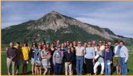
KUDOS TO THE MANY MISSION MOMENTS AT THE 2015 GRANT CELEBRATION

A new support group for teens impacted by cancer. An innovative collaboration between the schools and RMBL. Remote radio broadcast equipment making events, debates and forums accessible to the entire community. Just a few examples of your gifts seeding innovative, locally-focused programs for larger nonprofits and helping the many smaller, nonprofits fulfill their missions. You make it happen!