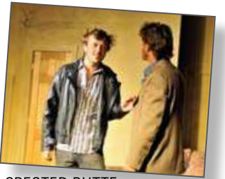
CRESTED BUTTE MOUNTAIN THEATRE