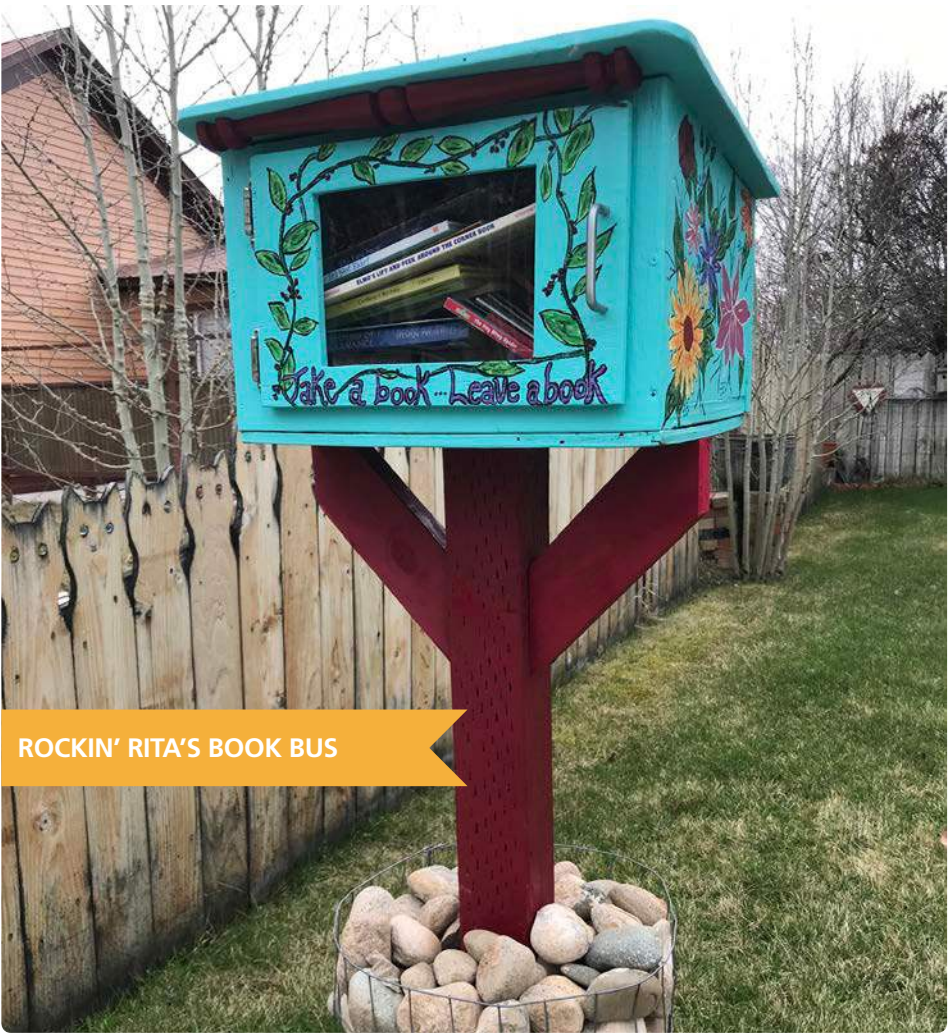
ROCKIN' RITA'S BOOK BUS

The Book Bus has added Book Nooks, giving more people access to reading all year long!