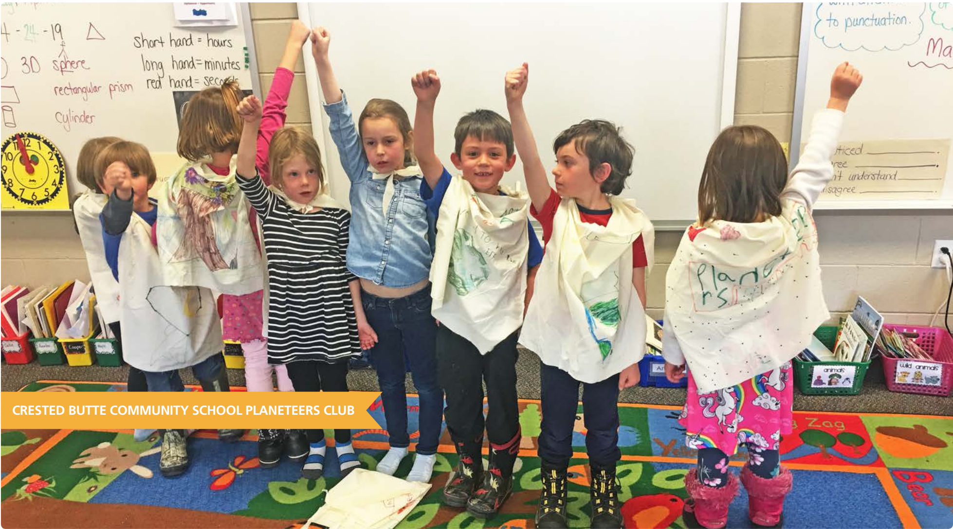
Kindergarten, first and second graders adopted a superhero power that would help the Earth – growing food, planting trees and recycling, to name a few.