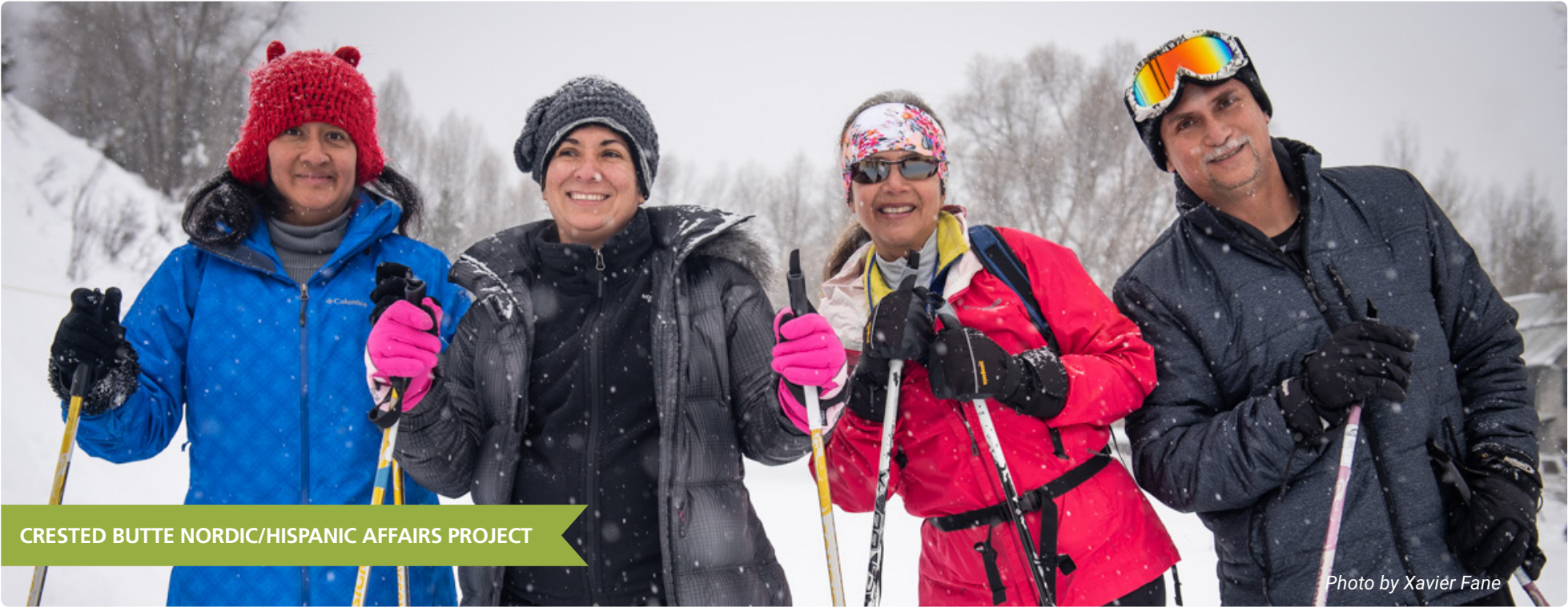
CRESTED BUTTE NORDIC/HISPANIC AFFAIRS PROJECT

Community is a place that we hold in common ... a place where we take initiative to make changes and share with each other ... a place where each citizen has duties and functions. And finally, a community is a place where people are comfortable to talk intimately, to befriend, to support, to grieve and to celebrate together.