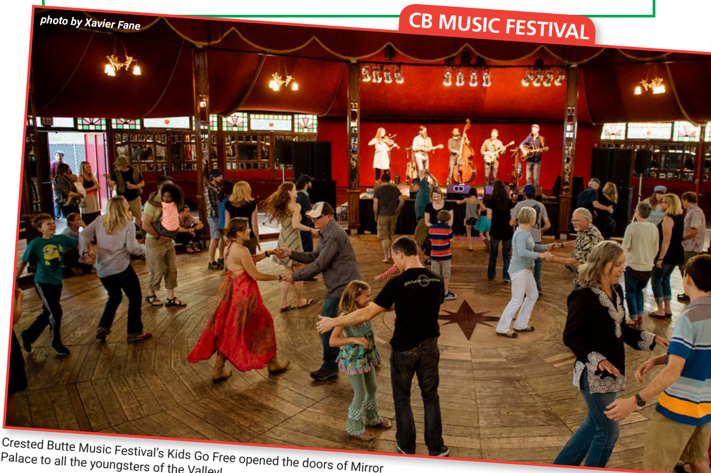
Crested Butte Music Festival’s Kids Go Free opened the doors of Mirror Palace to all the youngsters of the Valley!