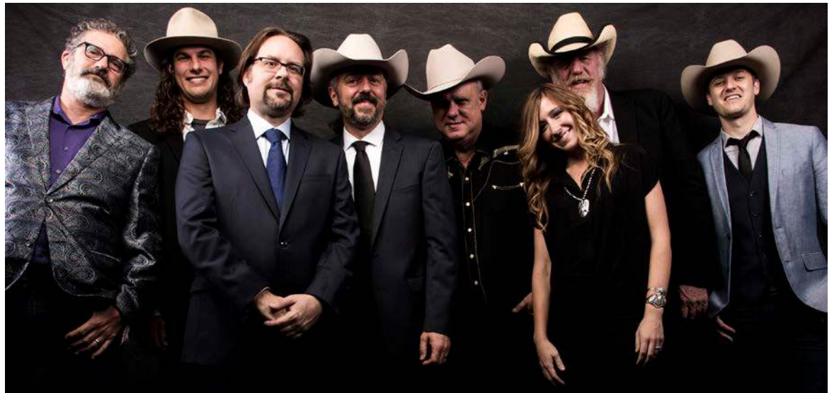
Asleep at the Wheel