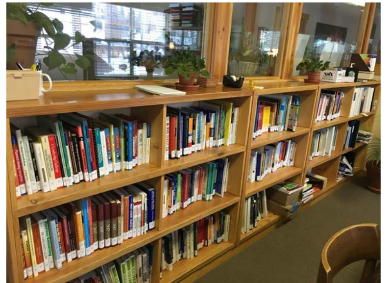
Resource Lending Library