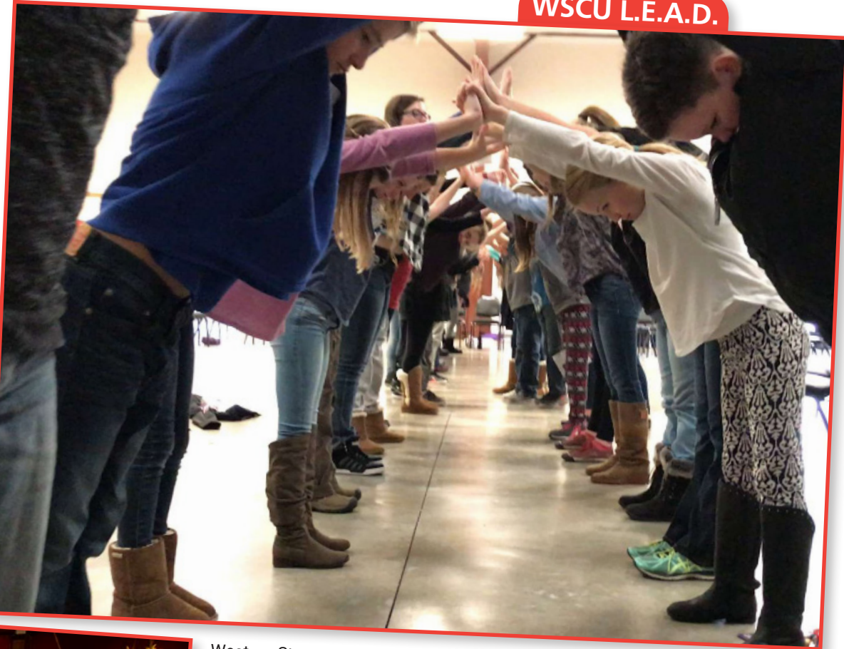
Western State Colorado University's LEAD Prevention brings the Valley's youth and young adults together to learn about suicide prevention and resources through Sources of Strength.