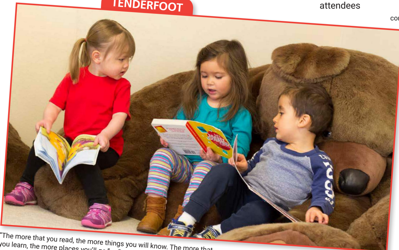
"The more that you read, the more things you will know. The more that you learn, the more places you'll go." – Dr. Seuss