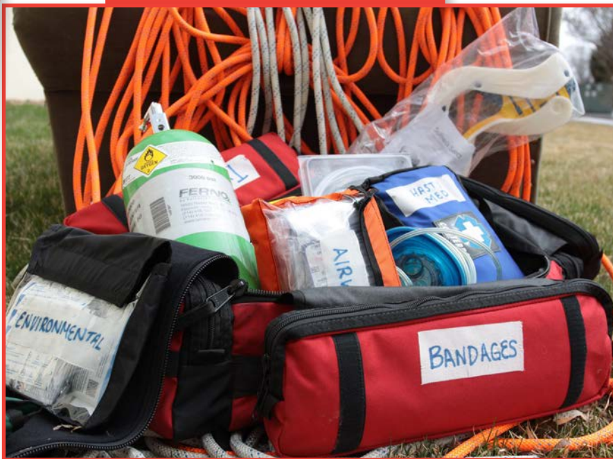
Western Mountain Rescue Team equipped a second vehicle with life-saving equipment. As the Valley gets busier, it's more common for the Team to run two search and rescue response calls simultaneously.