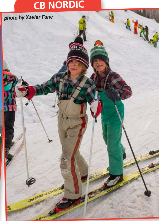
Crested Butte Nordic Team skills and training are complemented by lessons in balance, teamwork and community...especially when you’re sharing one pair of skis!