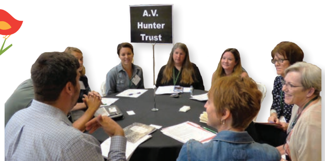
RURAL PHILANTHROPY DAYS ROUNDTABLE