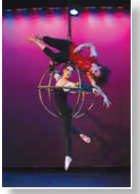
CENTER FOR THE ARTS