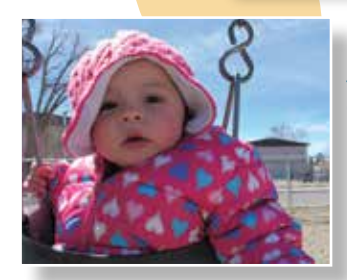
TENDERFOOT CHILD & FAMILY DEVELOPMENT