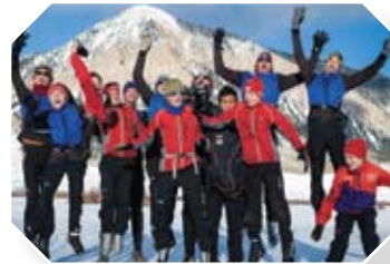
CBNT jumps for joy in new team uniforms. CRESTED BUTTE NORDIC TEAM