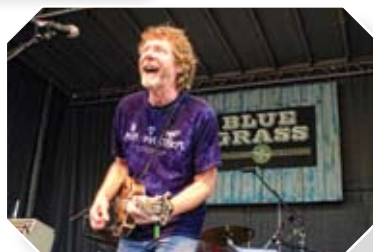
Music feeds the soul. World-class performances all summer long. CRESTED MUSIC FESTIVAL