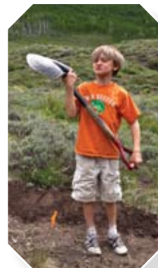
When I grow up . . . building community by building trails CRESTED BUTTE LAND TRUST