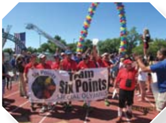
Scuff-proof shoes! Turning the ordinary into extraordinary by overcoming life's obstacles. Six Points clients take achievement and perseverance to the next level. SIX POINTS EVALUATION & TRAINING