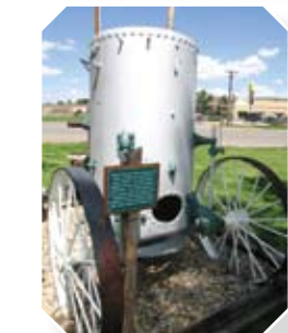
A moment in time. Preserving and sharing the past . . . for the future. PIONEER MUSEUM