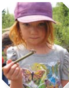
Touch, see, feel. Young scientists explore the world with hands-on field work.