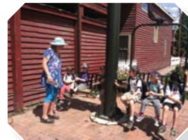
Learning from those who went first PARADISE PLACE VISITS CRESTED BUTTE MUSEUM