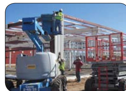
NEW BUILDING OCTOBER 2013

SUE UERLING, EXECUTIVE DIRECTOR OF SIX POINTS