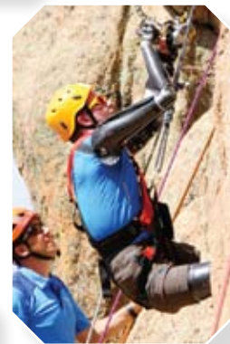
Reaching new heights! Imagine the determination and zest for life! ADAPTIVE SPORTS CENTER