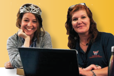
A DAY OF LEARNING – WITH SOME FUN SPRINKLED IN!