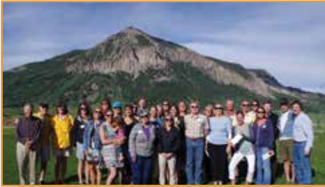
KUDOS TO THE MANY MISSION MOMENTS AT THE 2015 GRANT CELEBRATION

A new support group for teens impacted by cancer. An innovative collaboration between the schools and RMBL. Remote radio broadcast equipment making events, debates and forums accessible to the entire community. Just a few examples of your gifts seeding innovative, locally-focused programs for larger nonprofits and helping the many smaller, nonprofits fulfill their missions. You make it happen!